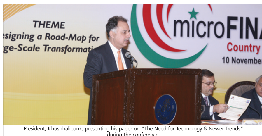
President, Khushhalibank, presenting his paper on "The Need for Technology & Newer Trends" during the conference.