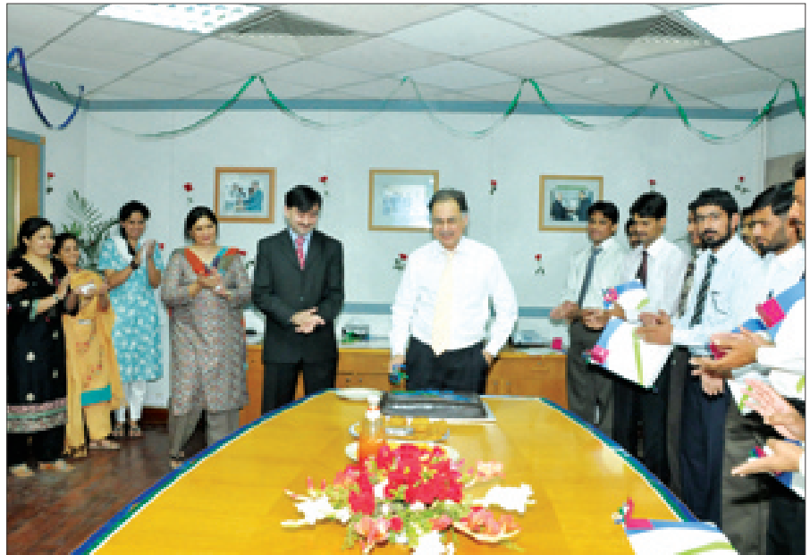
President, Khushhalibank celebrating the induction of hundredth batch of employees.